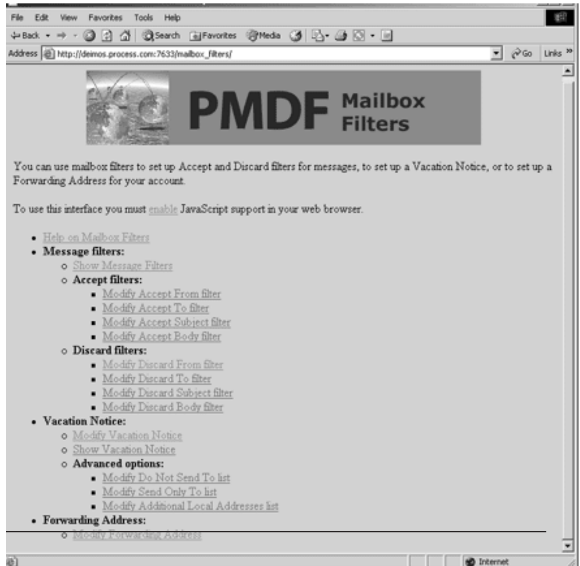
Figure 3–1 Mailbox Filter Home Page