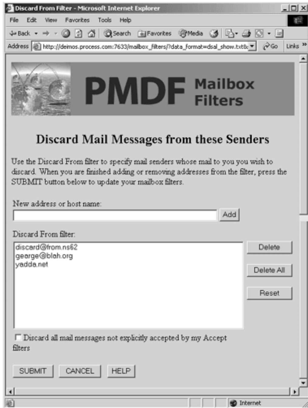
Figure 3-2 Discard From Filter