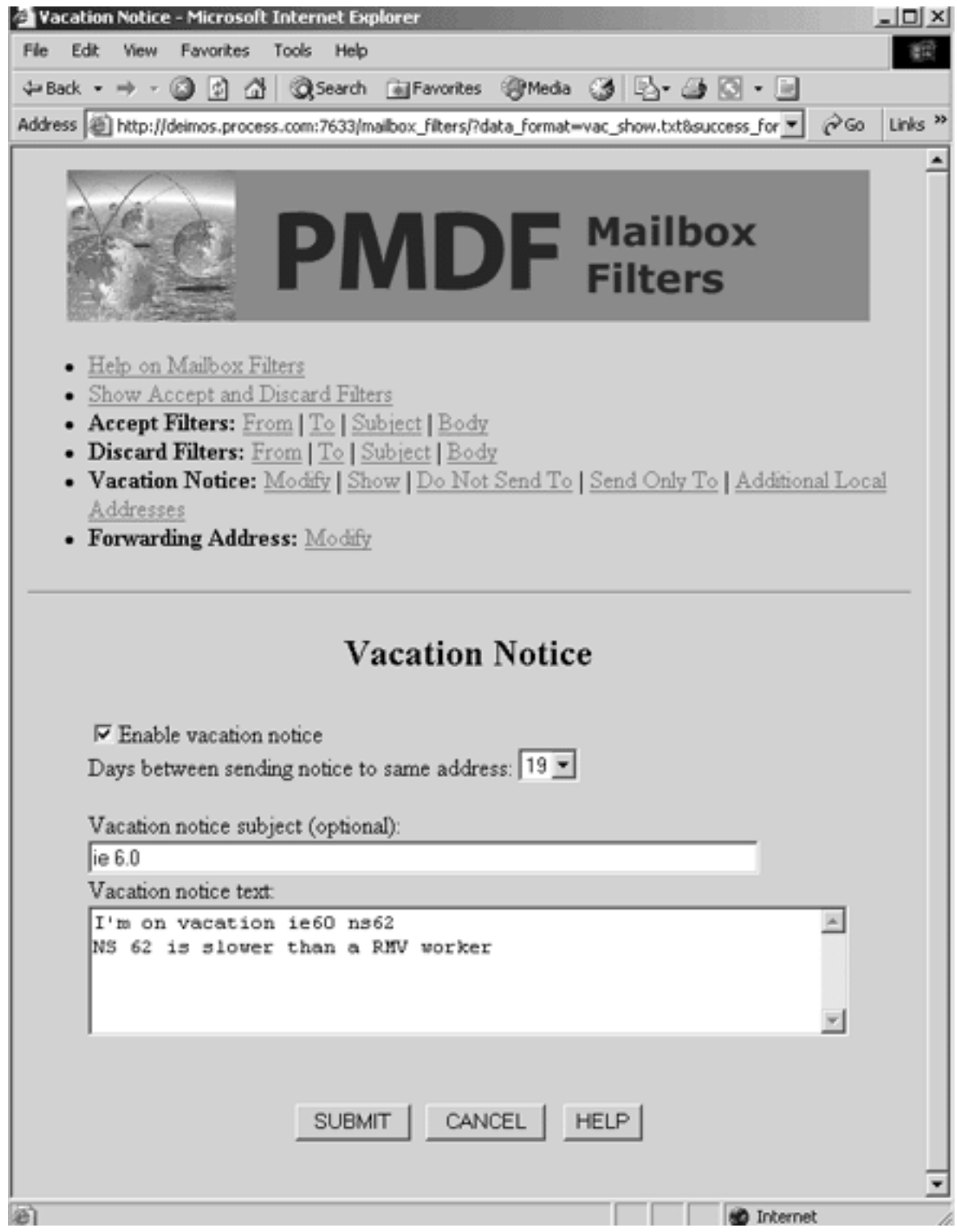
Figure 3-3 Vacation Notice